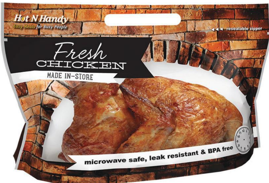
TC Transcontinental's Hot N Handy Pouch.

The editors caught up with representatives from Nordmeccanica, TC Transcontinental, MACTac and Bumble Bee Seafoods to give a well-rounded, comprehensive view on the flexible packaging industry, from the respective perspectives of an equipment manufacturer, converter, supplier and CPG. Here's a look at what each of them had to say from their position in the industry: